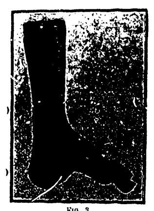
Plaster cast o' foot showing calcaneo-cavus.

ing from infantile paralysis is found in the lower extremities. It is extremely rare to find this disability symmetrically distributed