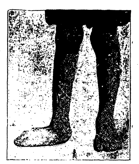
Fig. 4. Extreme flat-foot caused by infantile paralysis.

The mechanics of the various trunk deformities arising from infantile paralysis is a subject of much interest. If one limb has been paralysed in early life and has failed to recover or has recovered imperfectly, it does not grow equally with its fellow, and if the extremities are of unequal length the pelvis droops more or less on the side corresponding to the short leg, and the sacrum leans in the same direction. Built upon this slanting base, the lumbar vertebræ start upward, not perpendicularly, but inclined to the weaker side, producing a lumbar scoliosis followed