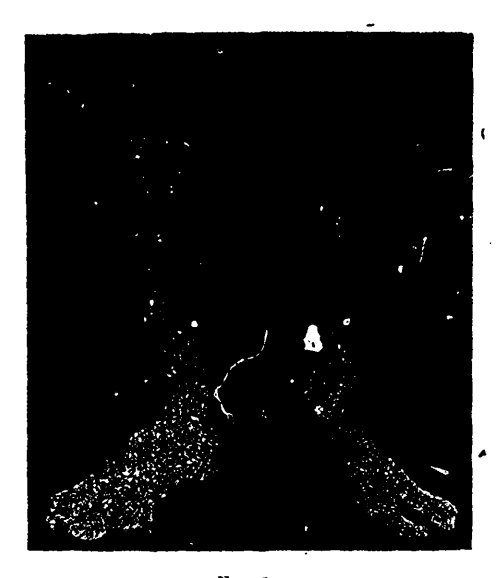
F10. 2. Result of operation on the foot shown in Fig. 1. The atrophy of the paralysed leg is well shown in this cut.

concussion (railway spine), neuritis, trophic disturbances following injuries. In presenting in an orthopedic paper such a formidable list of abnormal conditions of the nervous system, a word of explanation is necessary to prevent misunderstanding. The ordinary management of these affections is for the most part entirely outside the province of orthopedic practice, yet all of them may and do come under the observation of the orthopedic surgeon; some of them because they are symptomatic of other conditions which he is called upon to treat, but more usually because of deformities or disabilities to which they may give rise, or because of the need of therapeutic measures that are more frequently and systematically employed in orthopedic practice than elsewhere. In the present