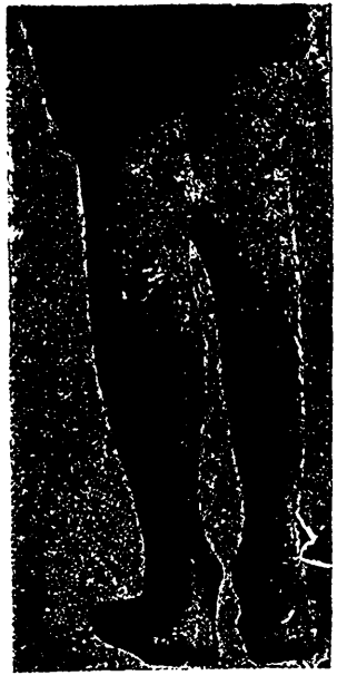
Fig. 7. Result of the operation of tendon-transplantation in such a case as that shown in Fig. 6. Unfortunately this particular patient was not photographed before operation.

measures in order to secure the best possible results. It is deplorable that these cases are so often regarded as incapable of improvement, the result being that the unfortunate patients usually drift into the hands of instrument makers whose ignorance of anatomy, physiology and pathology limits their therapeutic resources to the making of appliances which may be useful or quite otherwise. It requires knowledge and discrimination to decide which cases are best treated by mechanical means alone, and having determined that, what mechanical means will best accomplish the desired end. In a large proportion of cases disabled through anterior polio-