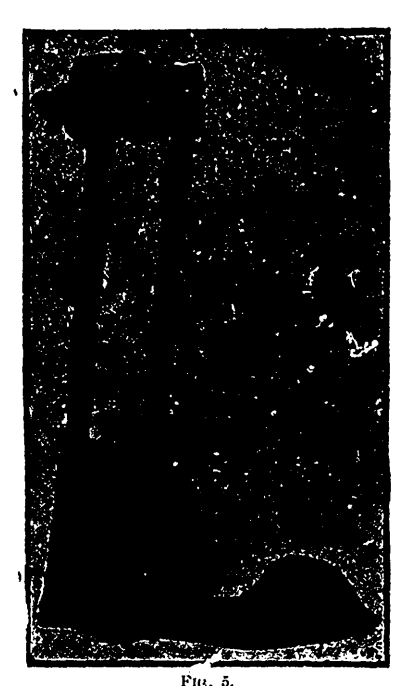
Appliance to be worn is, bed to prevent recurrence of deformity of the foot after operation.

that this is a very common cause of the deformity. There is no doubt, too, that deformities of the trunk are often due to direct paralysis of the trunk muscles: those of one side being weak, while those of the opposite side are vigorous, an unbalanced state results. Of more importance than the paralysis of the trunk muscles is the retardation of growth of the paralysed side. which is so constantly observed when the paralysis affects the extremities, operates with the same certainty when the truck is the part affected: consequently the development is asymmetrical.