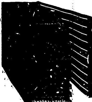
SECTION SHOWING PROCESS