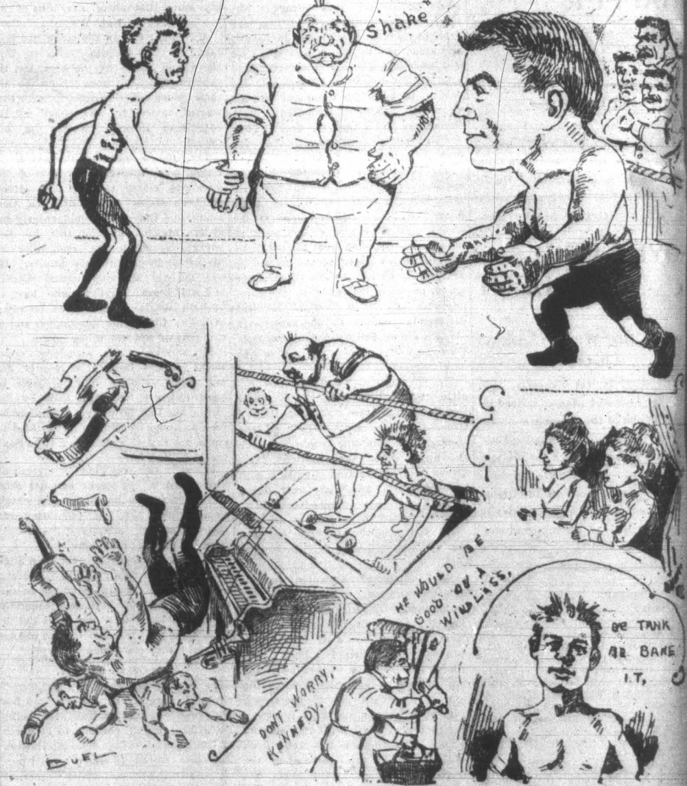
SKETCHES FROM THE WRESTLING MATCH.