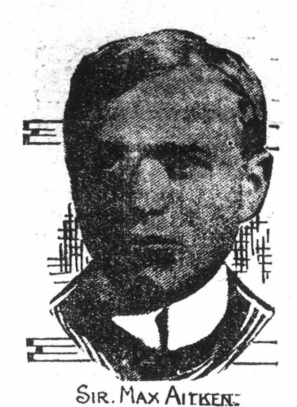
Director of Calgary Power, Whose Annual Statement Has Just Been Issued.

London cable says the Peninsular and Oriental Steamship Co. has declared an interim dividend of 6 per cent, against 5 per cent last year. It is expected that for the full year ending in September a dividend of 20 per cent will be paid, compared with total payment last year of 15 per cent.