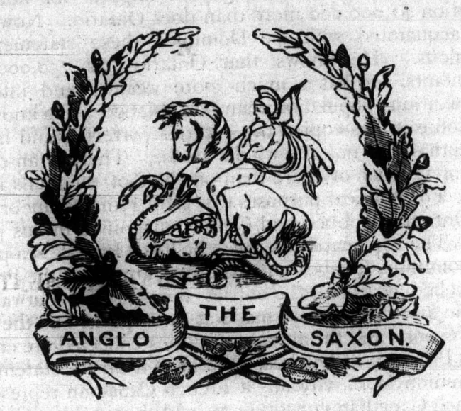
A Monthly Journal devoted to the interests of the Anglo-Saxon race in Canada.