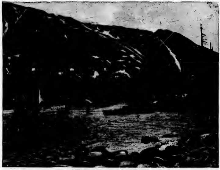
EMBARKING, LAKE LINDERMAN.

it drop down with the current. Wiborg remained on board to steer, for if a boat sheers or yaws when going over rapids, she is likely to careen and capsize. We three greenhorn geologists held the line, with which we waded in the shallower parts of the current, and scampered over