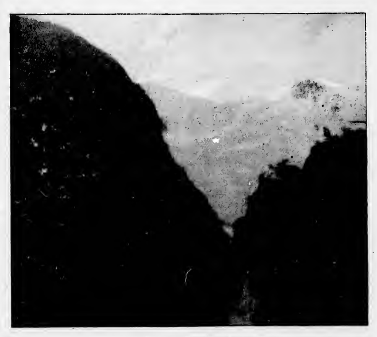
AN ARM OF THE DYEA GLACIER.

The day after passing the Klundek village we arrived at the mining-camp of Forty Mile. We had reached the edge of the Klondike. Our next effort would be to see the gold producing country about which we had heard so much.