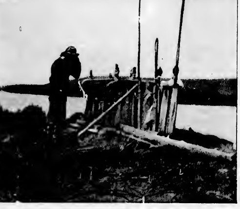
INDIAN GRAVE AT PELLY POST.

the center of the channel than on the sides. Waves rushing in every direction are also generated, forming a very puzzling chop. Two or three of these waves presently boarded us, so that I was thoroughly wet, and then came a broad glare of sunlight as we emerged from the first half of the