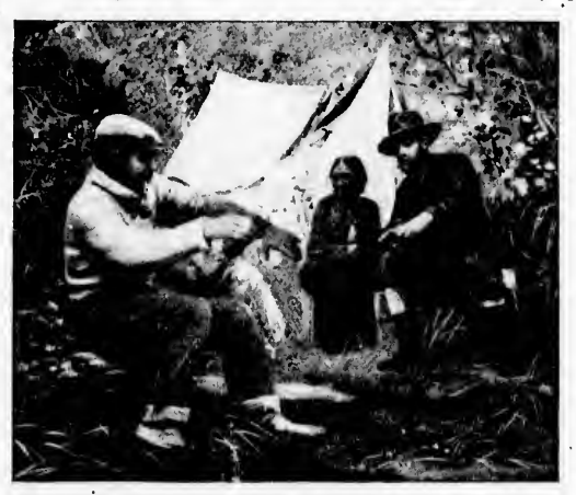
AT SHEEP CAMP,

the. same way, but use straps which they fasten to the article to be carried: with our paeksae k s. however, they were much pleased, and all anxious to be allowed to earry them, in preference to more difficult bundles, in the trip across the With pass. this apparatus a man