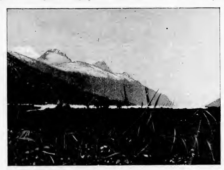
LOOKING DOWN DYEA INLET.

miners. It happened that these men were the very ones who had so strongly urged holding out against the increased price; and as it took all the available Indians to carry their outfit over, we were delayed a couple of days by this, Finally, however, we secured packers,