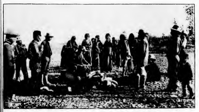
DRIVING A BARGAIN WITH THE NATIVES.