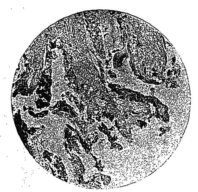
PROCESS CONTAINING SYNCYTIUM. HIGH POWER.