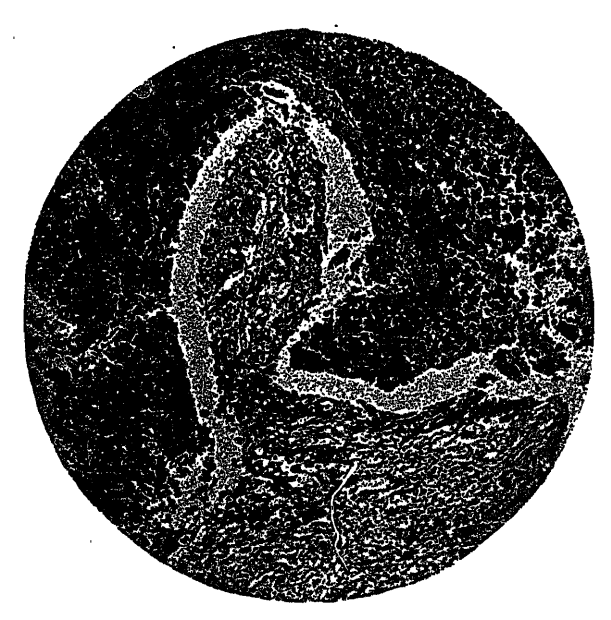
SYNCYTIAL MASS WITH BLOOD SPACE. (HIGH POWER.)