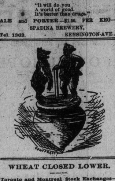
WHEAT CLOSED LOWER.

I had been troubled five months with Dyspepsia. The doctors told me it was chronic. I had a fullness after eating and a heavy load in the pit of my stomach.