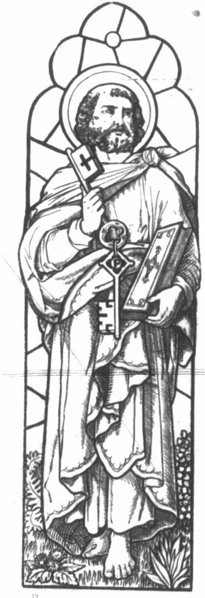
Glass of Every Description 141 CHURCH ST., TORONTO.