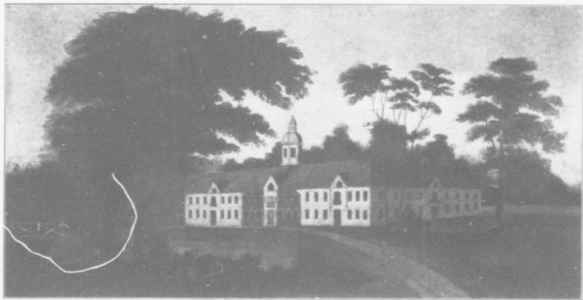
QUEBEC LUNATIC ASYLUM IN 1850