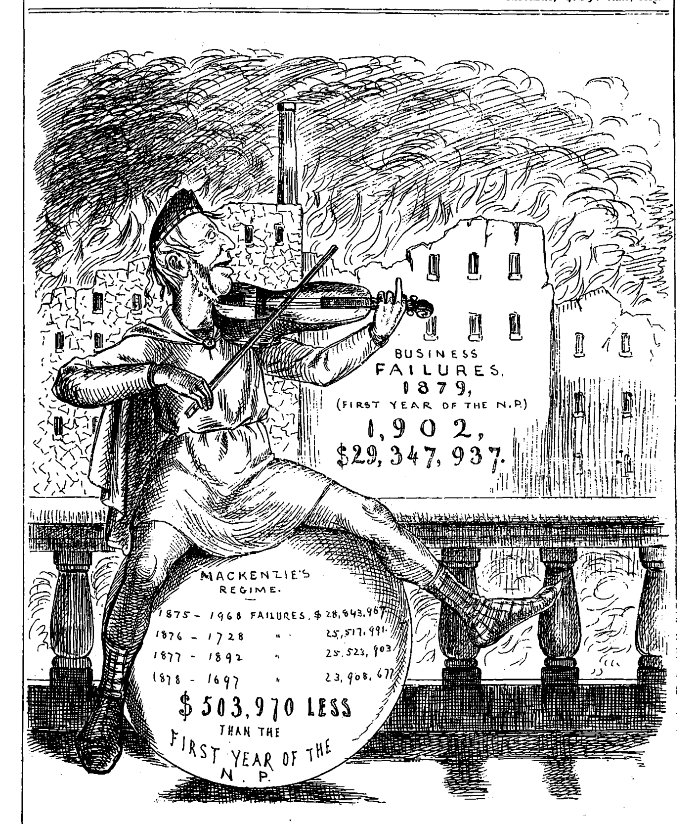
THE MODERN NERO.

FIDDLING AT THE DESTRUCTION OF CANADIAN COMMERCE.