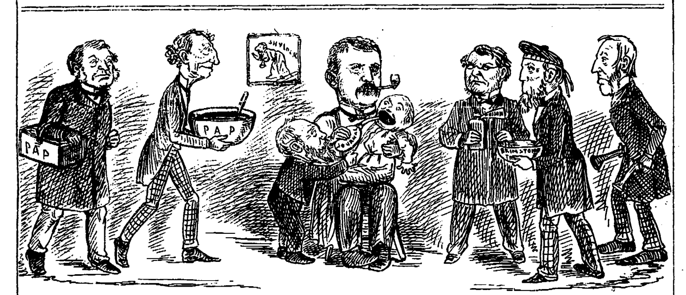
THE RAG BABY GROWS MORE INTERESTING EVERY DAY.

O! wud some power the giftie gie us To see oursels as ithers see us!