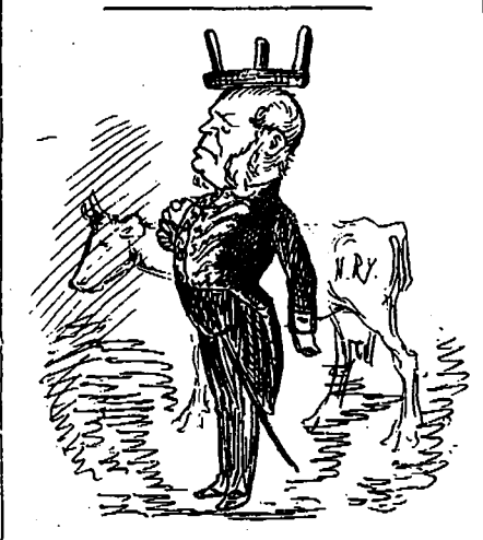
Our New Lt. Governor.

That the Rag Baby can become a worse nuisance than at present.