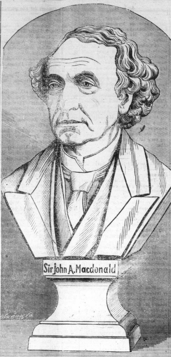
Sir John A. Macdonald