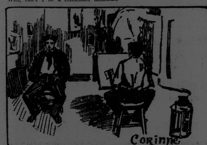
IN A QUANDARY. Tom—I hope you are not going to marry the widow for her money. Dick—Not if I can get it any other way.