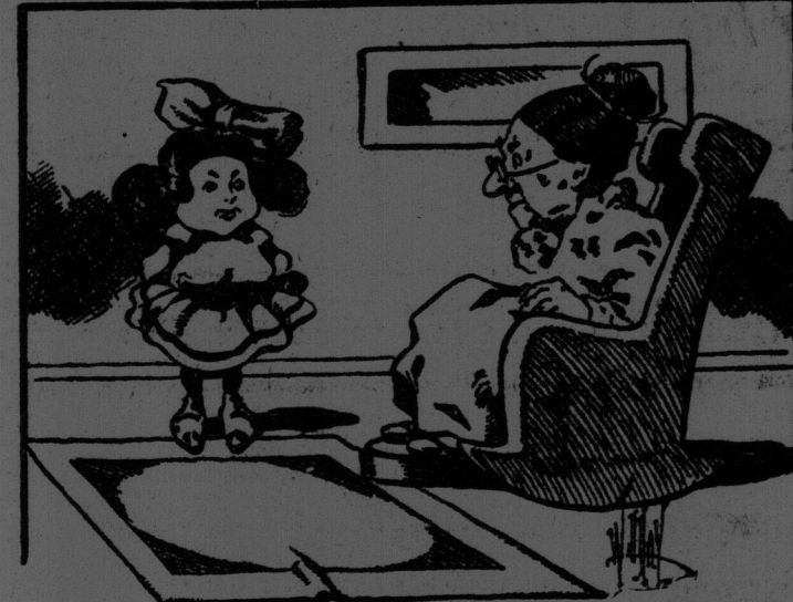
DETERMINED TO GO. "Mamma, mayn't I go to the fancy dress ball as a milkmaid?" "You are too small." "Well, can't I be a condensed milkmaid?"