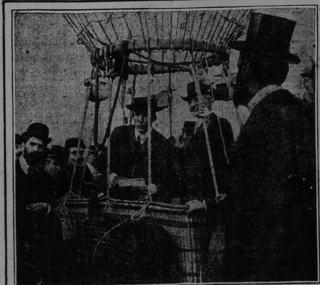
IMPROMPTU LAMB AND MAKER HURRY OUT BEFORE THE START.