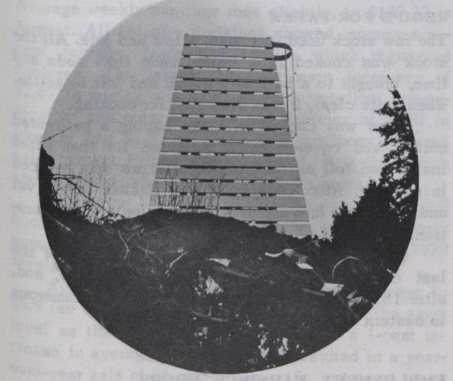
The completed range tower faces out to sea as the late afternoon light fades quickly. To get this shot, photographer Walter Parker had to stand ankle-deep in sea-water, so close is the tower to the water's edge.

After the oil-tanker Arrow had ruptured herself on Cerberus Rock at the entrance to the Canso Strait, spilling a million gallons of oil along 120 miles of shoreline in Nova Scotia's Chedebucto Bay, clean-up attempts – never wholly successful – cost a lot of money. If the ecological disaster can be said to have had any beneficial effect, however, that must be the resulting installation in the Straits of Canso of one of the most modern navigational systems in the world.