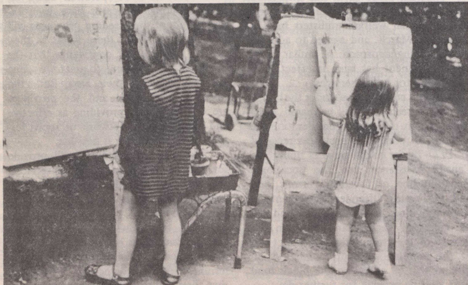
Working parents and budding artists depend on day-care centres.

The first results from the survey should be available in 1979, with yearly reports thereafter.