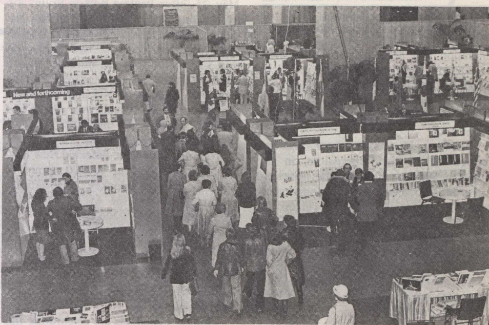
Publishers and film producers from many countries negotiate rights for products on display at the Montreal International Book Fair.