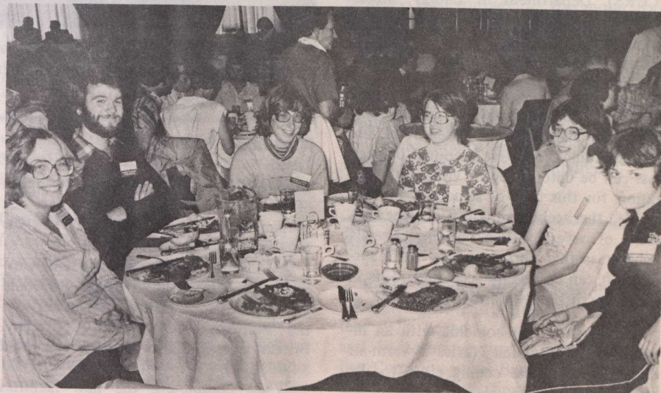
High school students visiting Ottawa on a four-day visit, sponsored by the Rotary Clubs across Canada, lunch at the Château Laurier Hotel.