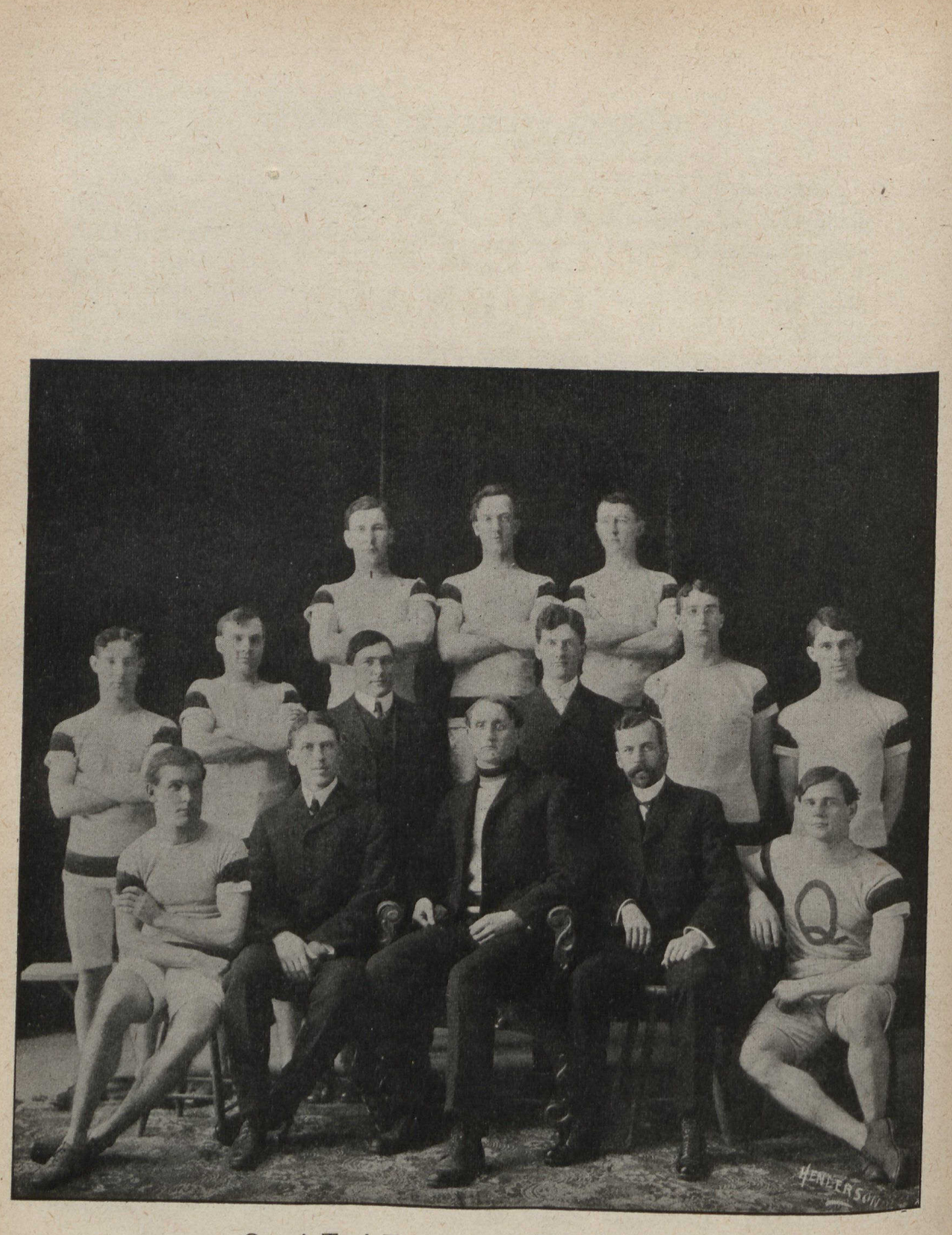
Queen's Track Team and Track Club Executive.