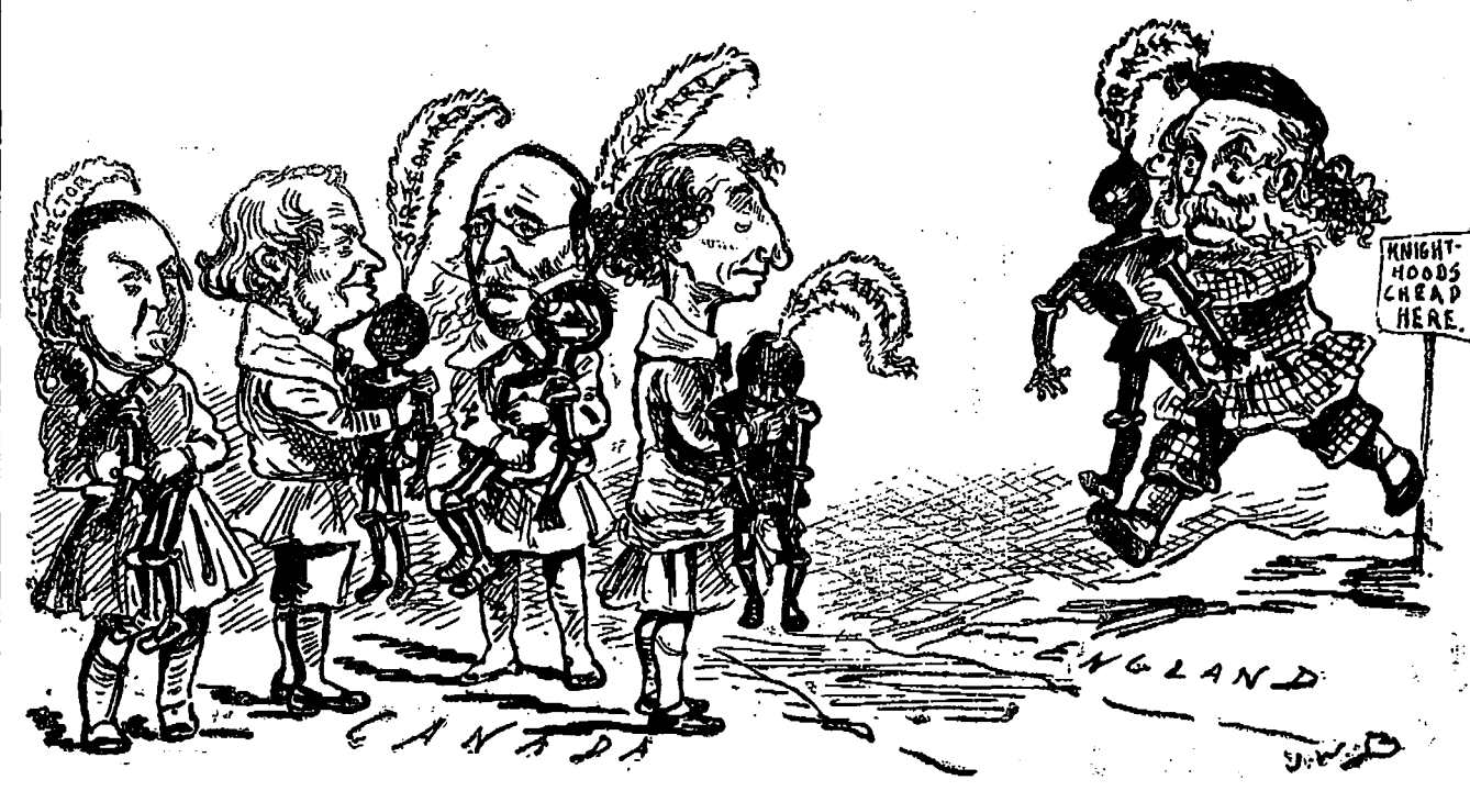
ANOTHER CANADIAN BABY MADE HAPPY,

MACHINE OILS { Four Medals and Three Diplomas awarded at Leading Exhibitions in 1881 } McCOLL BROS. & CO., TO