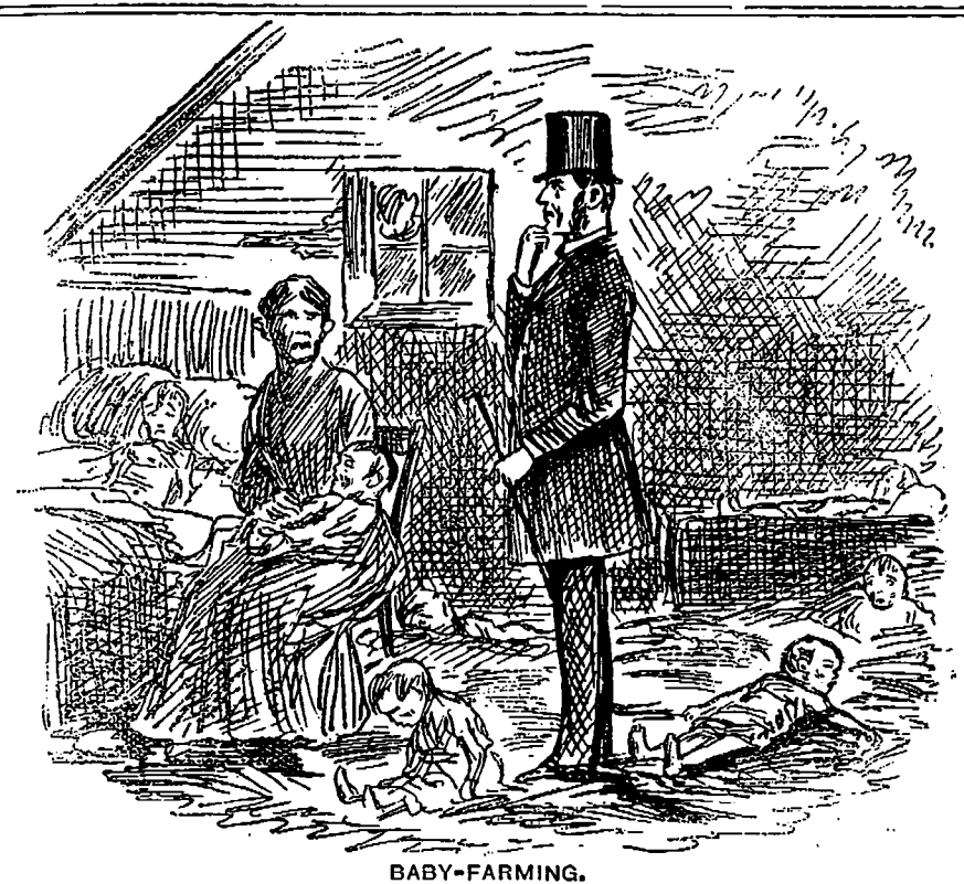
Doctor-(aside)-Hum! This looks scaley. Iv'e half a notion to mention this to the authorities .- [But he doesn't.]