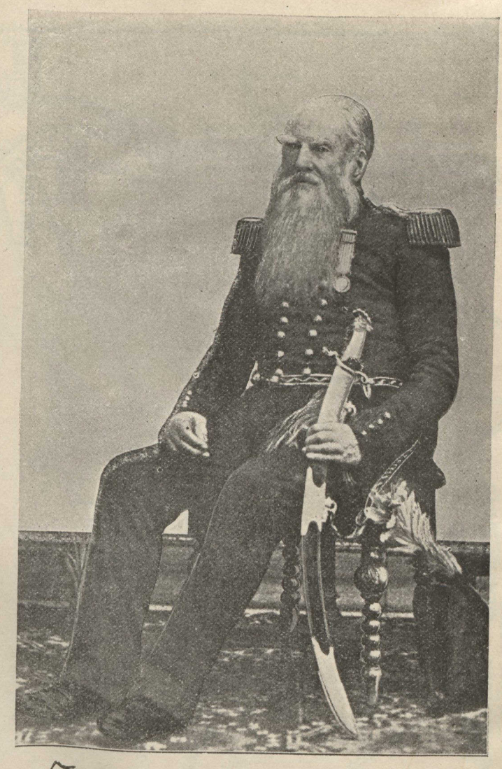
Jours incenes Ets Sebbon