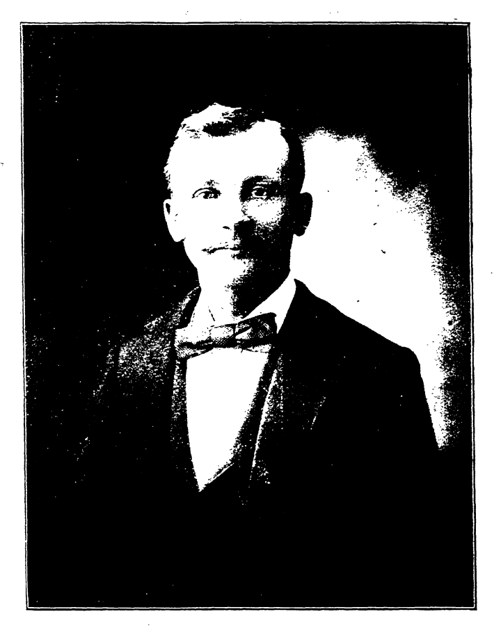
Faithfully Jours gol It Steat M. B