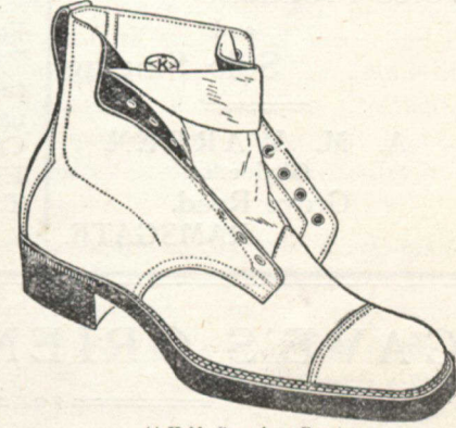
'K'' Service Boot

Campaign, Riding, Dress and Long Boots always in stock, in sizes and half sizes