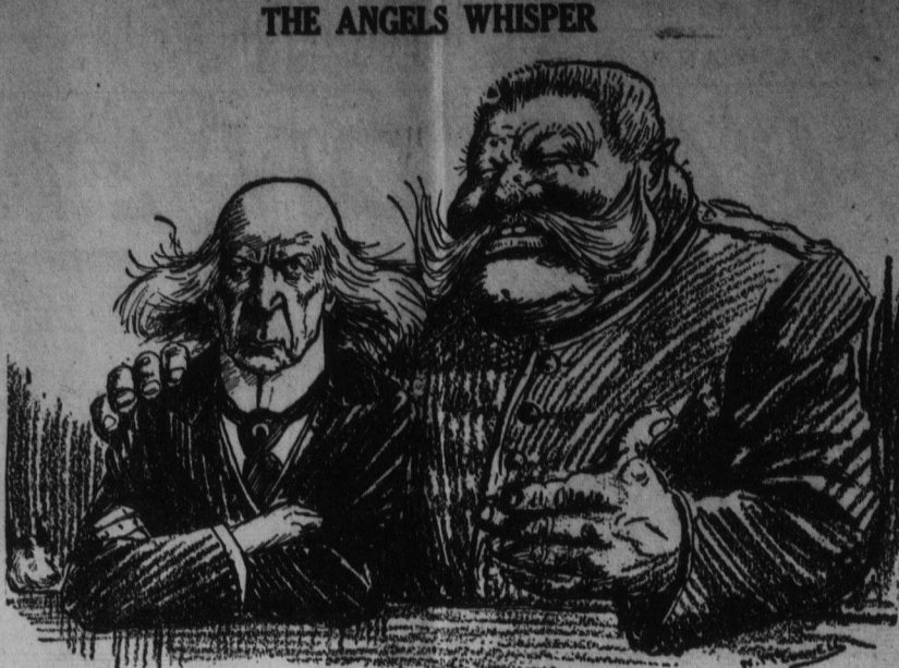
Hindenburg: "Ve wants you to sink der Kanadian Ship of State and leave no trace."

Petrograd, Sept. 28.—The Russians have captured Oromaru, twenty-four miles west of Mori, in the Caucasus, it is officially announced. Brave Scotchmen. British front in France, Sept. 27.—(By Associated Press)—The two companies of Argyll and Sutherland Highlanders, who made such a remarkable stand on Tuesday and Tuesday night in the face of overwhelming odds