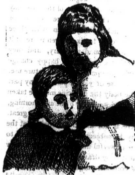
116 WORMS IN ONE DAY.

Pills. It should be borne in mind that the Pills must be taken in such quantities as will operate two or three times on the bowels; otherwise you will receive but little benefit. As they are made from plants and roots, they may be taken, not only without danger, but with perfect safety, and great benefit realized in every case.