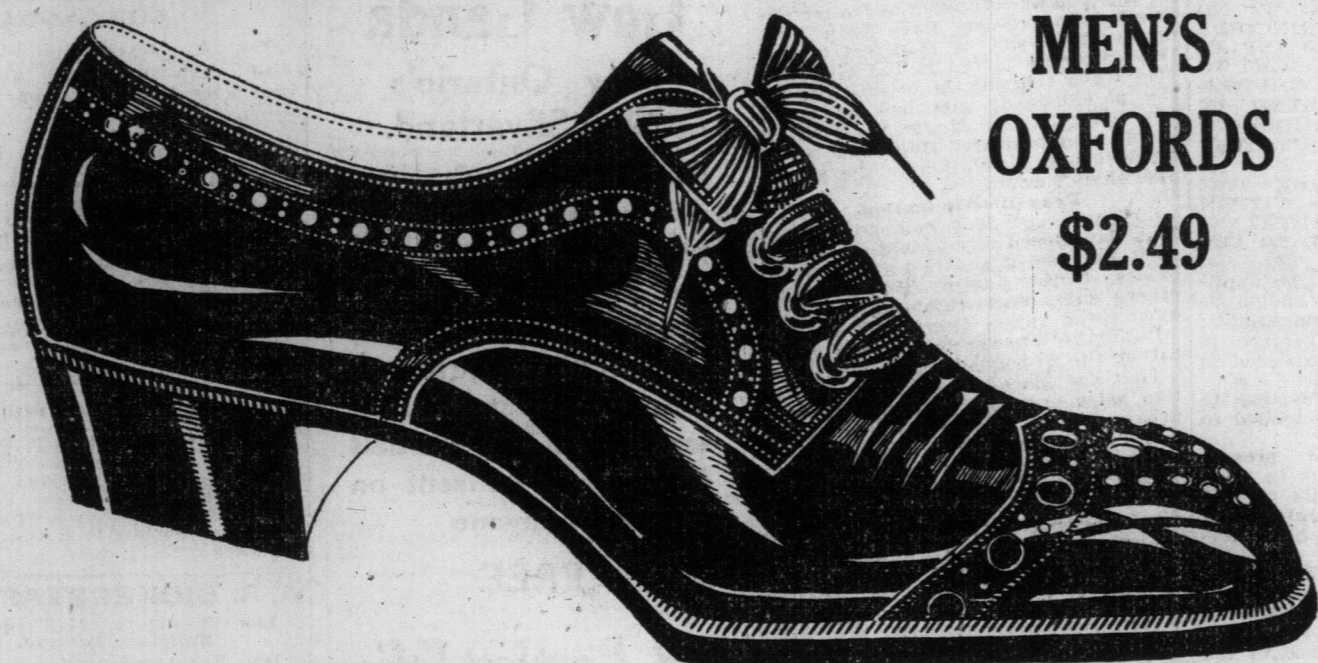
MEN'S OXFORDS $2.49