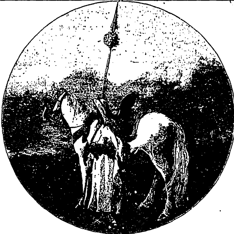
GOD'S FOOTPRINTS. (See page 162.)

sure to die," and there wouldn't be enough left to raise a respectable family.