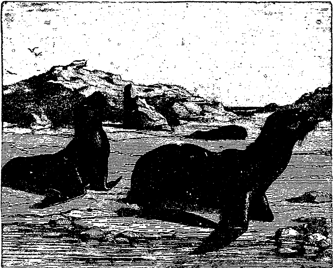
CREATURES OF NORTHERN SEAS.