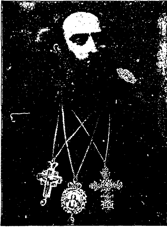
THE PATRIARCH OF ARMENIA. See page 146.

London, alone told him that nothing could justify the breaking of such a promise as he had given to his confiding servant.