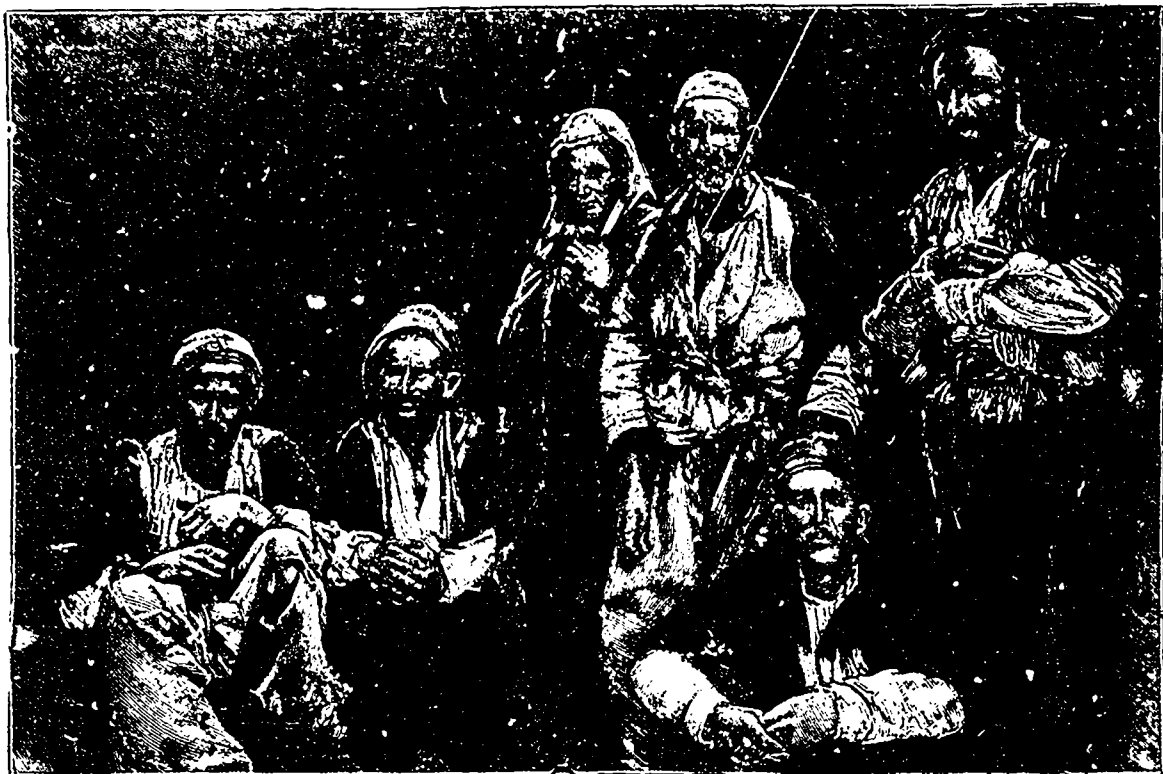
GROUP OF ARMENIANS.

driven from their devastated homes by the ruthless Kurds from the mountains, they have carried into other lands the same commercial instincts as the Jew, the same keenness in trade, the same faculty of growing rich; and wherever they are met with they are still Armenians, the ancestral type unchanged; but, at the same time, always peaceable and submissive subjects.