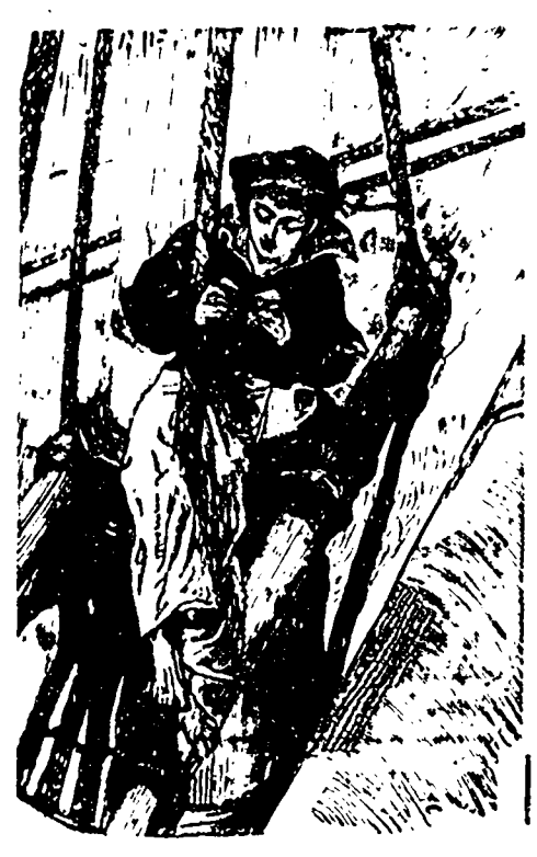
A QUEER PLACE TO READ.