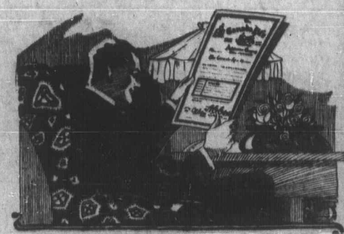
t age 30 he secured his $5,000 Twenty Pay Life Policy.

A true story of a Canada Life Policy issued over forty years ago.