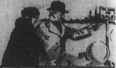
At age 60 his Policy, still earning Dividends, helped him to finance the purchase of a new home,