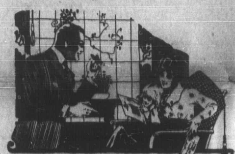
age 35 he received his first Dividend which was added to the Policy.