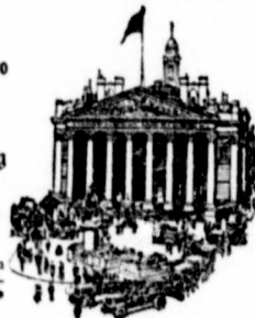
Head Office: Royal Exchange, London

Correspondence invited from responsible gentlemen in unrepresented districts re fire and casualty agencies