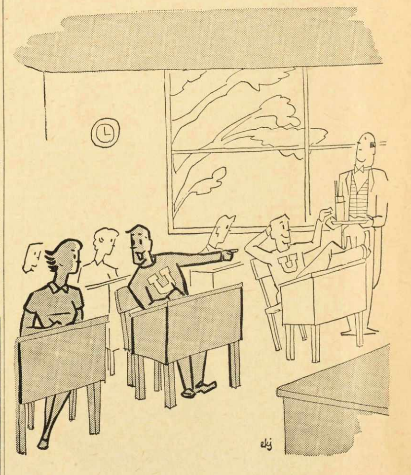
He says he does it by Steady Saving at the Bank of Montreal*

*The Bank where Students' accounts are warmly welcomed.