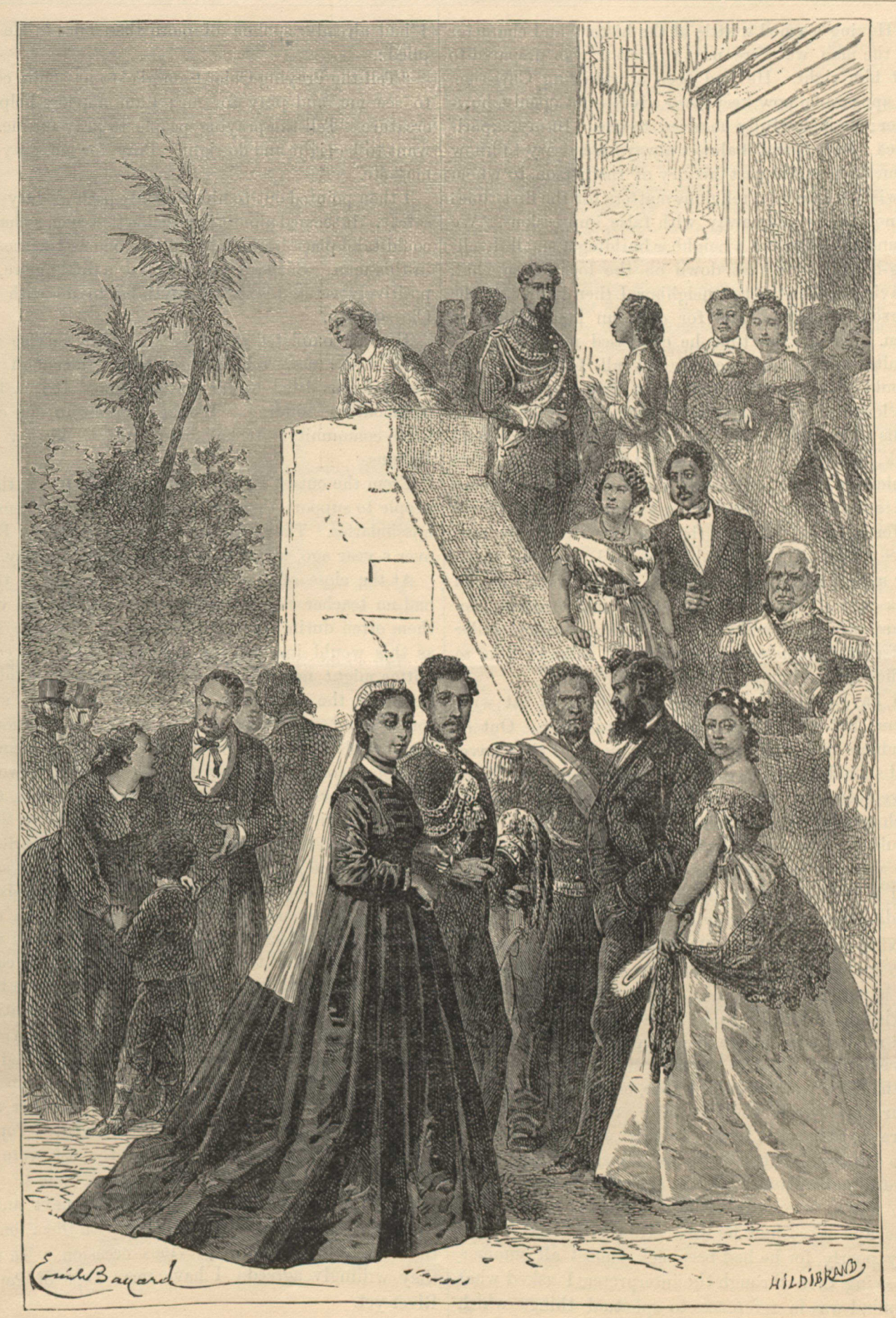
ROYAL GARDEN PARTY, HONOLULU.