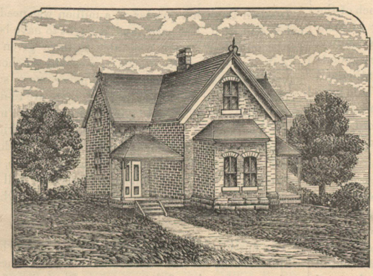
DESIGN No. 1.