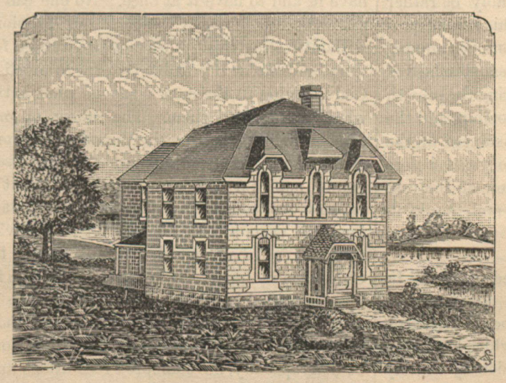
DESIGN No. 10.