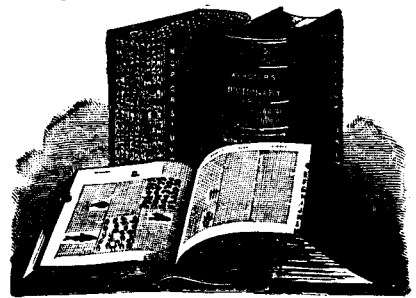
The latest issue of this work comprises