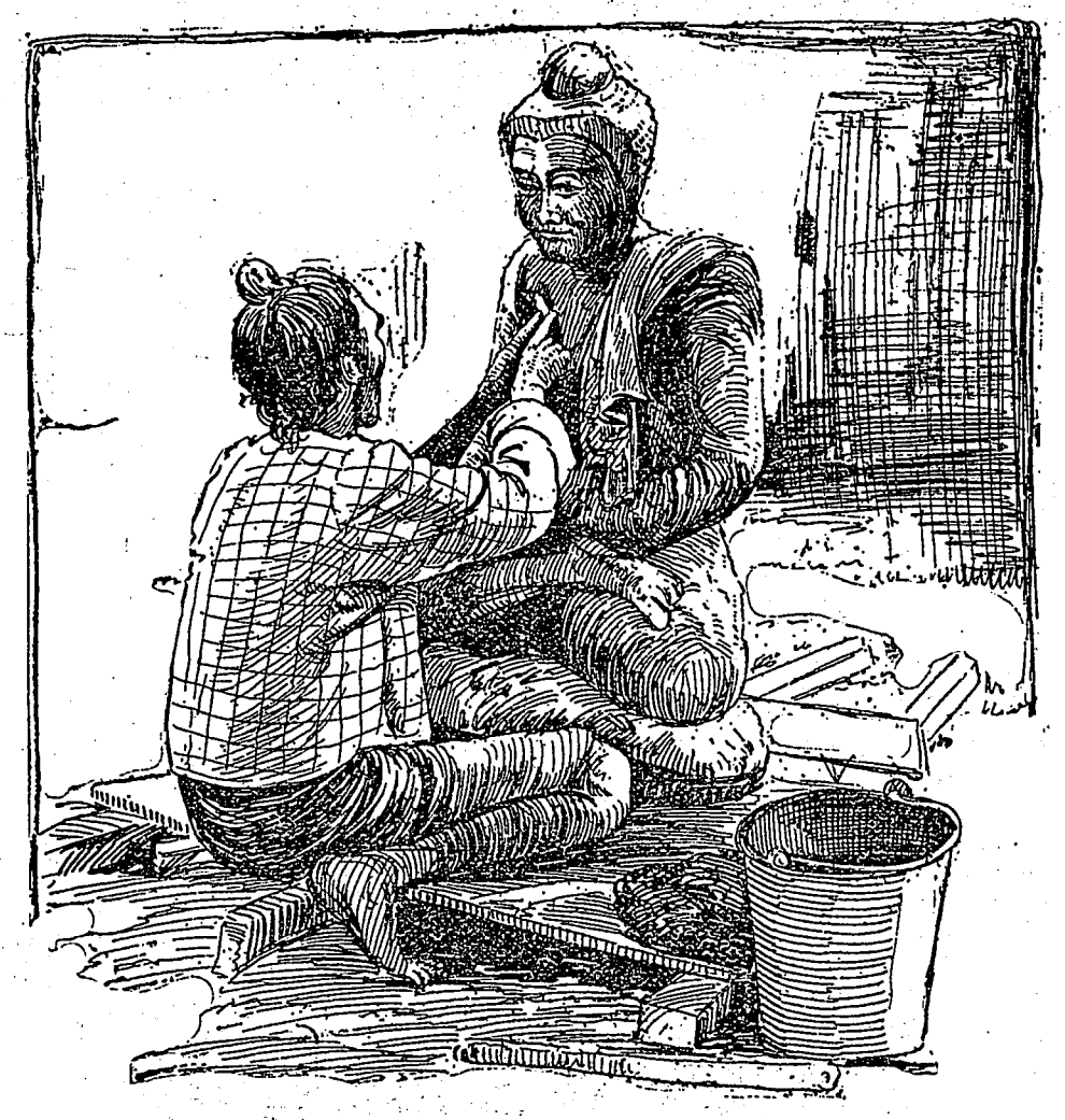
THIS IS A HEATHEN MAN'S IDOL — WHAT DOES YOUR IDOL LOOK LIKE?

'Who hath formed a god, or molten a graven image that is profitable for nothing. * * He maketh a god and worsnippeth it; he maketh it a graven image, and falleth down thereto * * * and worshippeth it, and prayeth unto it, and saith, Deliver me; for thou art my god. He feedeth on ashes; a deceived heart hath turned him aside that he cannot deliver his soul,