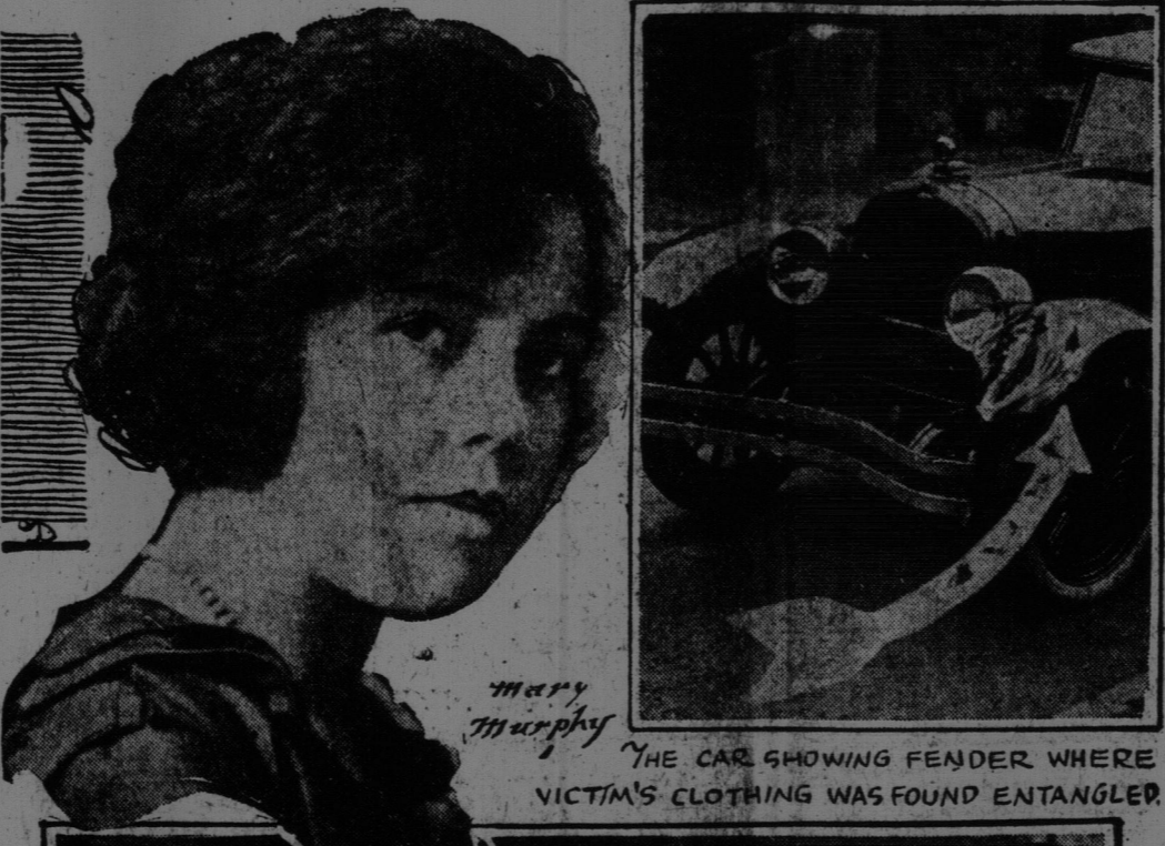
THE CAR SHOWING FENDER WHERE VICTIM'S CLOTHING WAS FOUND ENTANGLED

Philadelphia, March 9.—If his automobile, wrecked, blood-stained and with a woman's necktie twisted in its wheel, is identified by witnesses, which occurred just as the car was spinned on a street car after returning home from a party.