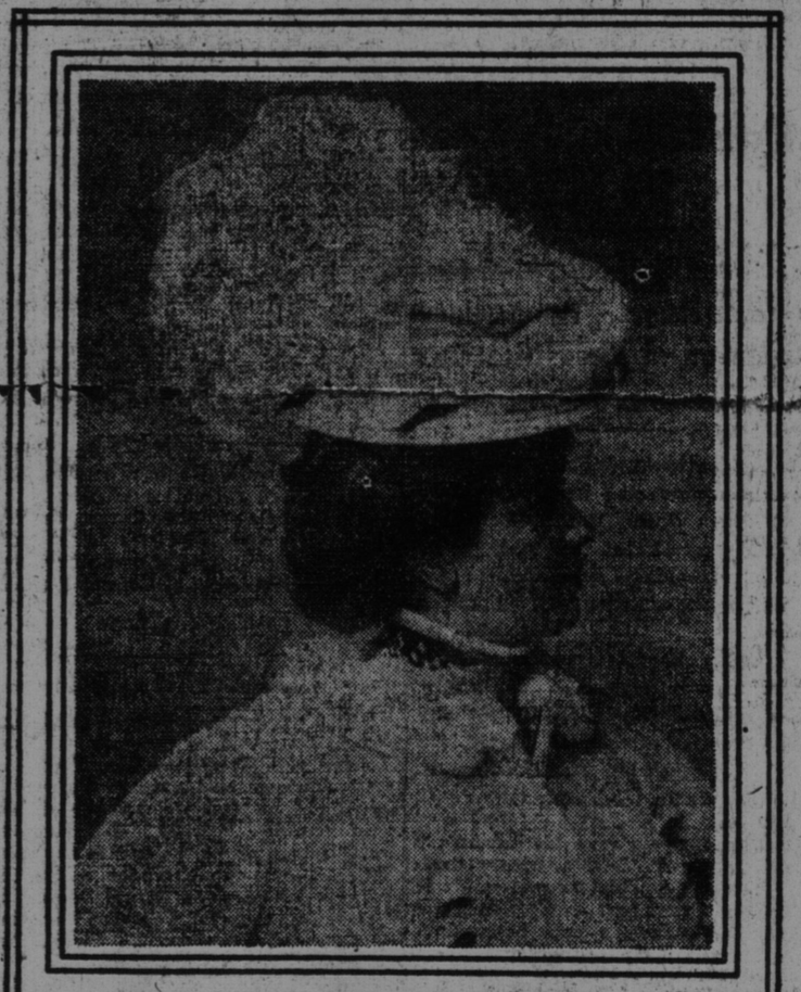
WHITE VELVET, WHITE PLUMES AND BERMIN. There is absolutely no prospect that white will be replaced in fashionable wear by any other color, whether for fur, military or gowns.

combination of the sailor and Charlotte Corday shapes, and is altogether in white satin velvet, this finish being far more approved for military purposes than is the chiffon velvet that is so modish in other departments of dress.