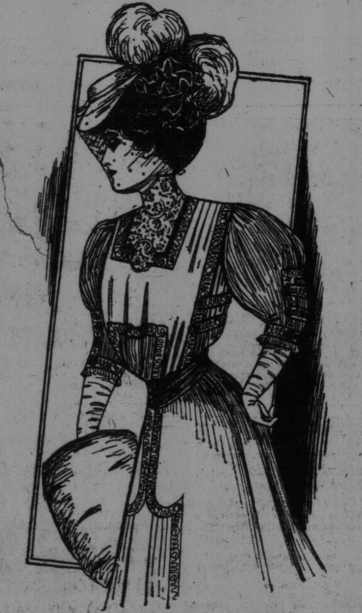
WAIST TO ACCOMPANY BROADCLOTH SUIT. The sketch shows a good model for a cloth bodice. The trimming was contrived of straight bands of the cloth braided with narrow soutache of the same shade.