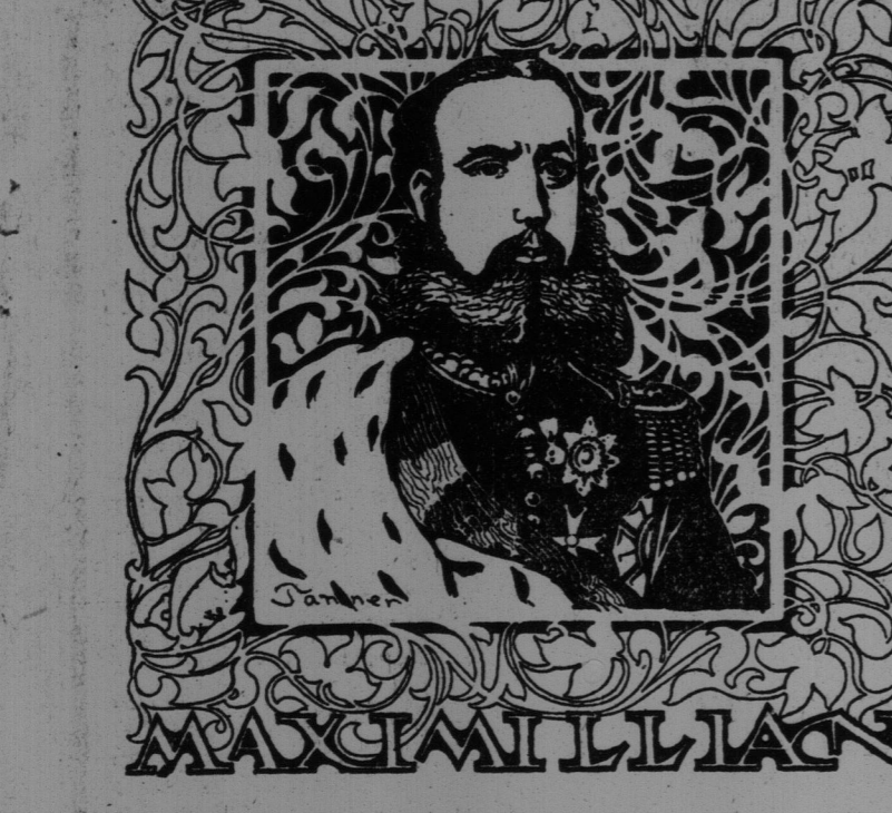
November 23, 1867—Thirty-nine years ago today, the Mexicans gave up the body of the ill-fated Emperor Maximilian. Find one of the executioners.