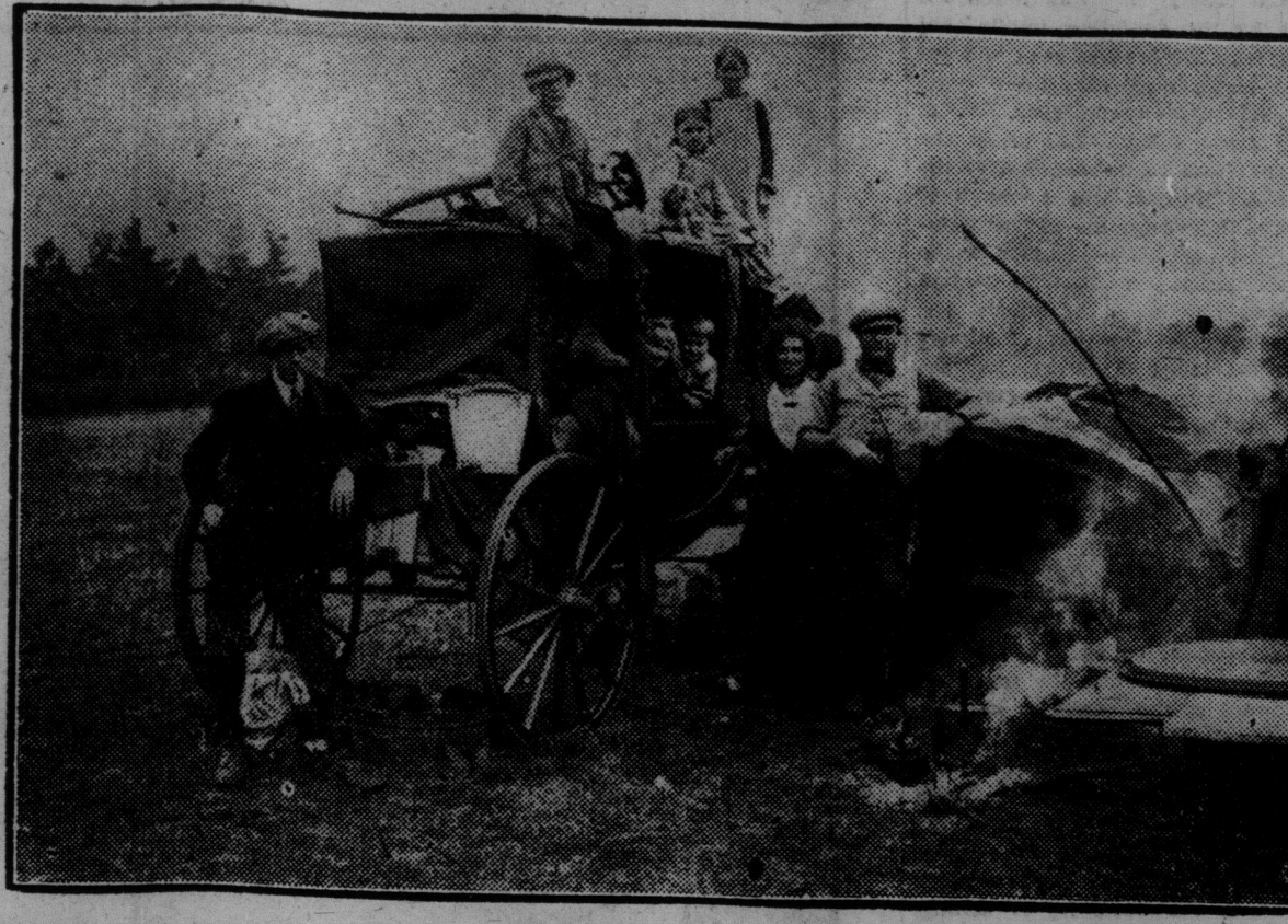
Seyny. The reports indicate that the Lithuanians are advancing in the di-Photo shows a large family of hoppers, who live and travel the country in an old cab. Sleeping space is very limited, but at night they also make use of the hut on the right.