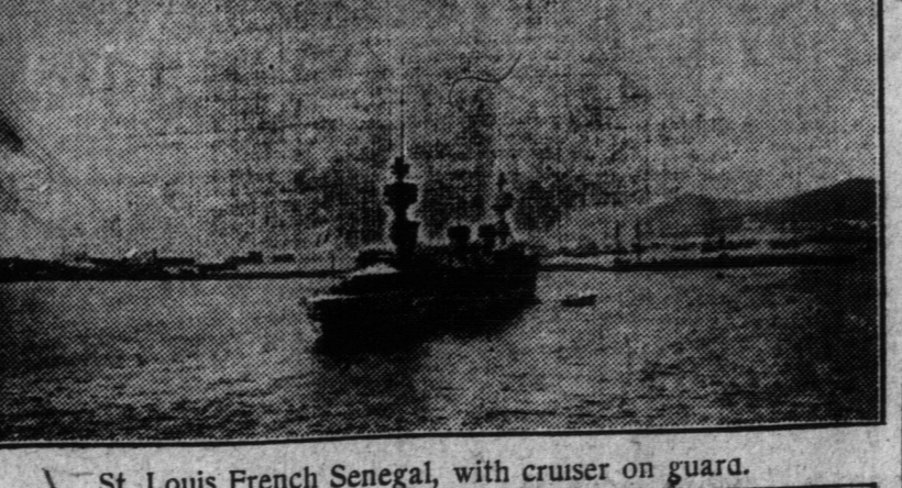
St. Louis French Senegal, with cruiser on guard.