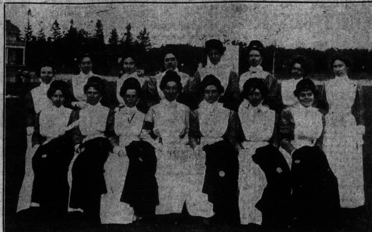
Fifteen members of the St. John Ambulance Brigade Nursing Sisters, who have volunteered for active service.