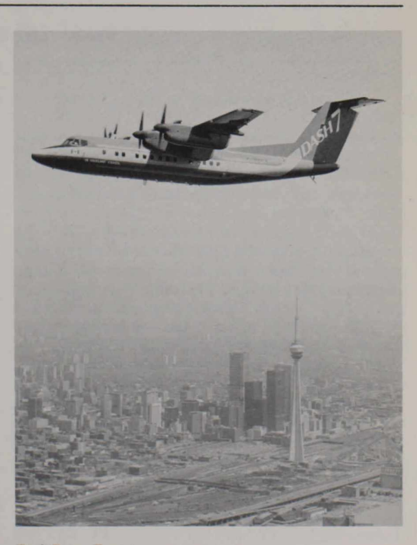
Dash 7 over Toronto.

Both the Canadian Forces and the Alaska National Guard use Twin Otters for search and rescue missions and other humanitarian projects.