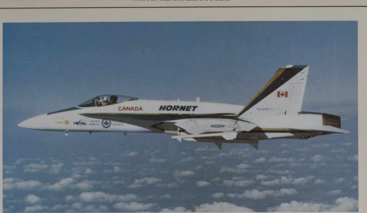
Canadian Forces — Air Command CF-18 Hornet.

sive training in February, 1981. They are part of a five-year experiment begun in the Forces in 1979 to assess the performances of women in roles that traditionally have been assigned to men.