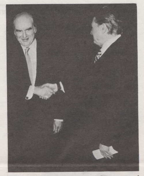
Deputy Prime Minister and Secretary of State for External Affairs Allan J. MacEachen (right) greets Greek Prime Minister Andreas Papandreou at the Ottawa International Airport.

Lévesque and members of the National Assembly.