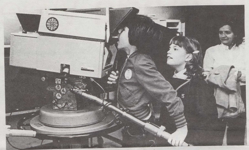
Children's programming will receive assistance under the program.

The strategy sets a broad goal for the exhibition of Canadian programs: as a general principle, the Canadian broadcasting system must provide a significant amount of Canadian programming in each