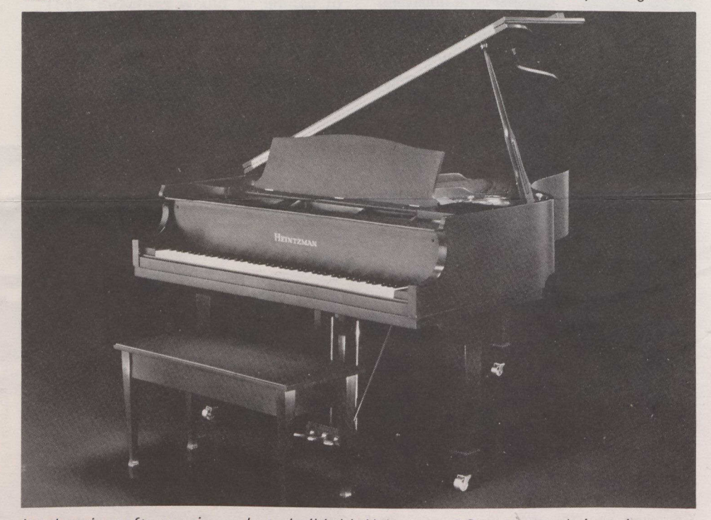
It takes six craftsmen six weeks to build this Heintzman 1.8-metre grand piano. Its soundboard is made from selected Northern Sitka spruce and is supported by curved ribs to ensure lasting resonance. Twelve thousand components combine to achieve the shaping, voicing and feel known only in a Heintzman.

Despite the current world-wide economic environment, the Canadian musical products industry has maintained an annual growth rate average of about 15 per cent — which has outpaced gains in