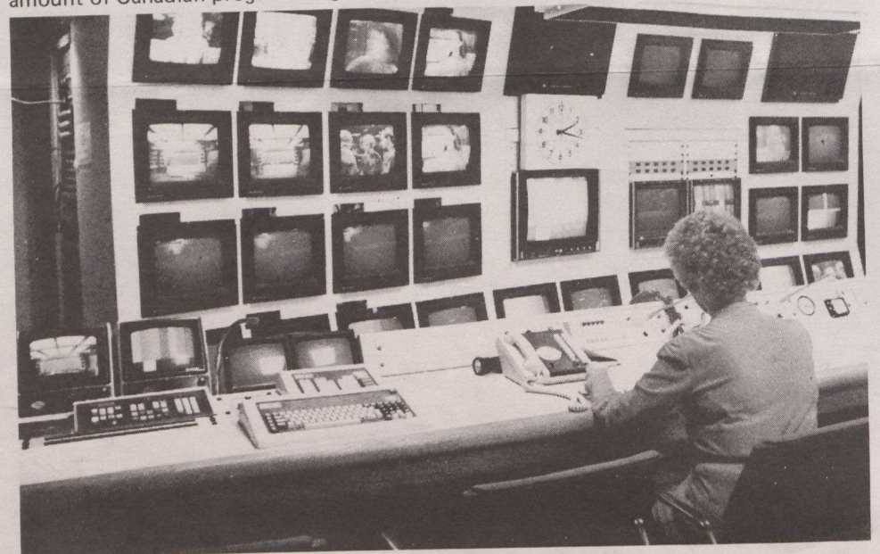
The policy will allow broadcasters to respond to future broadcasting challenges.

Specifically exempted from the Cabinet's power of direction would be such matters as: the issuing of a broadcast