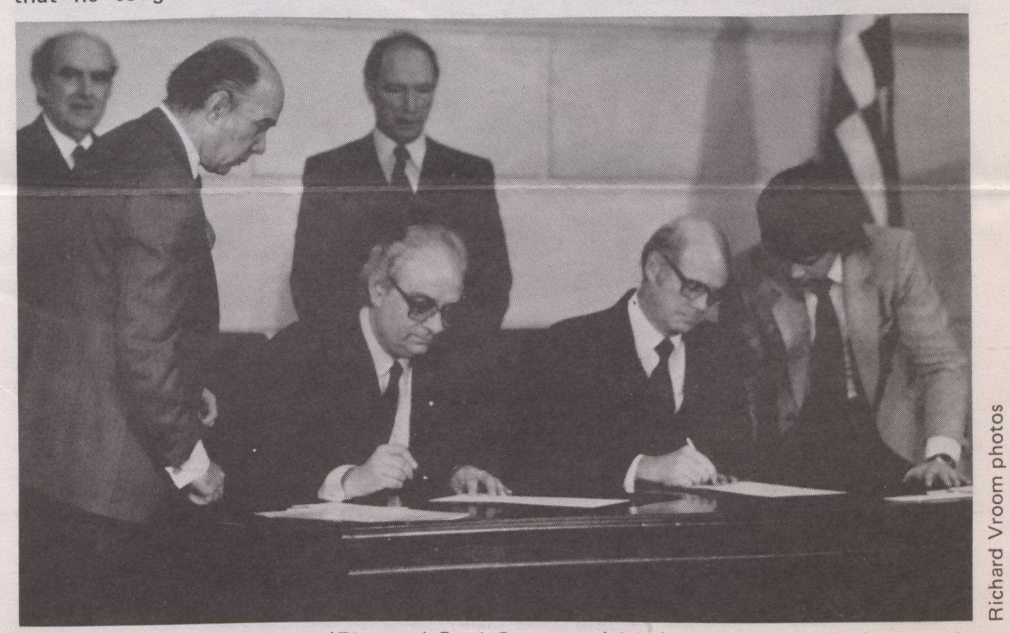
Canadian Minister of State (Finance) Paul Cosgrove (right) and Deputy Minister to the Presidency for Greeks Abroad Asimakis Fotilas sign the protocol ratifying the Canada-Greek social security agreement. Prime Minister Trudeau (standing right) and Prime Minister Papandreou (standing to the extreme left) look on.

Afterwards, the Greek prime minister was guest of honour at a dinner hosted by federal Consumer and Corporate Affairs Minister André Ouellet. Mr. Papandreou also flew to Quebec City to meet with provincial Premier René