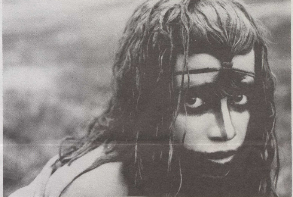
Quest for Fire, a majority Canadian co-production with France won for best make-up.