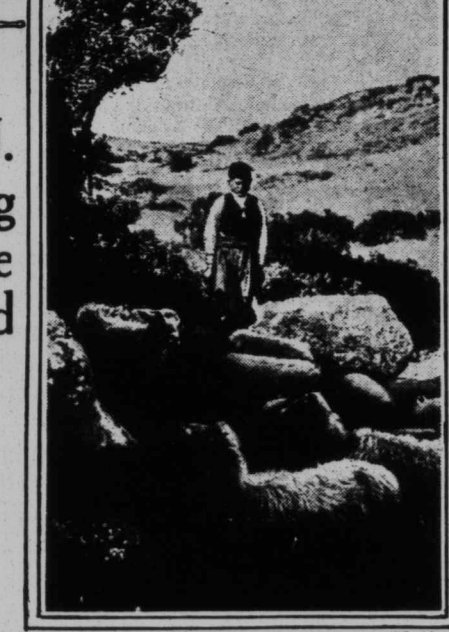
Neighbors of the Excavators Were the Modern Cretan Shepherd Boys

museum a town situated on a steep and lofty mountain crag in eastern Crete where the successors