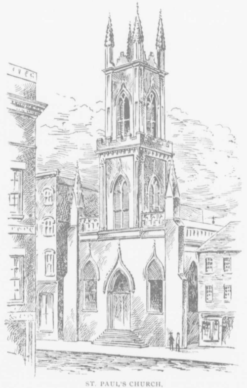
1828 to 1851. Woodward Avenue, near Congress Street. Removed in April, 1852.