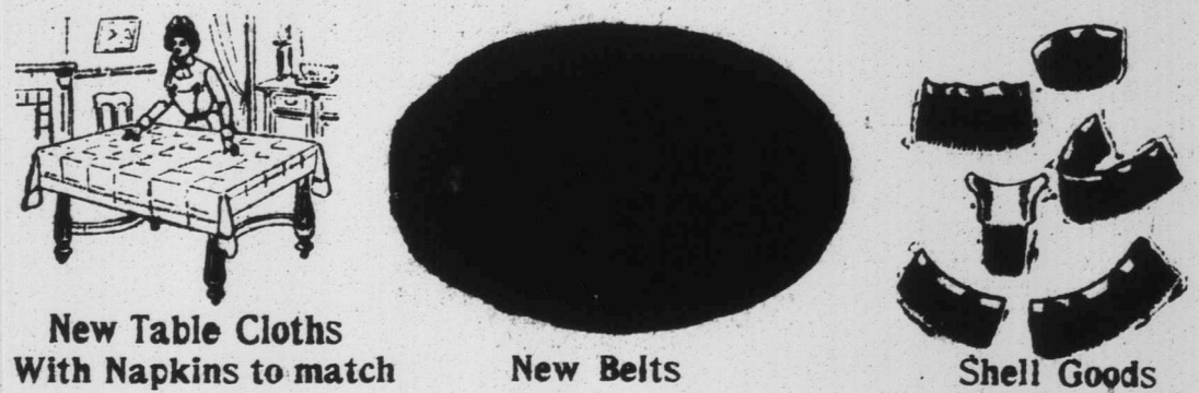
New Table Cloths With Napkins to match