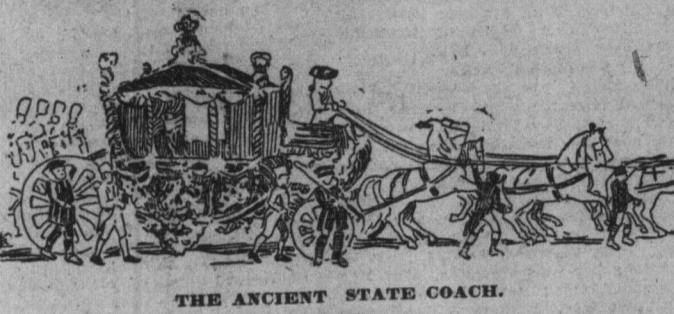
THE ANCIENT STATE COACH.

London, Feb. 14.—The first Parliament of the reign of King Edward VII. was opened this afternoon by the King in person. His Majesty was accompanied by Queen Alexandra, the Duke of York and Cornwall, the Duke of Connaught and many others of the royal family. The last state ceremony of the kind occurred in 1861, when Queen Victoria opened Parliament, accompanied by the Prince Consort, and since the death of the latter nothing equal to today's pomp has been witnessed in London in connection with the opening of the Legislature. Not since the wedding of the then Prince of Wales and Princess Alexandra has the gorgeous state coach used to-day been seen in the streets of the capital. In this coach to-day the King and Queen rode from Buckingham Palace to the Palace of Westminster.