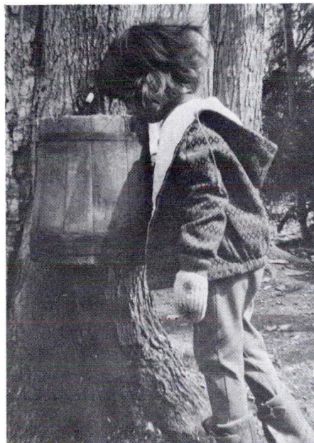
A young visitor to the sugar-bush peeks into an old-style wooden sap-bucket.

For the best sap-production, a tree should have a short bole topped with abundant foliage. Successful management of a maple grove consists largely in obtaining the greatest possible number of such trees.