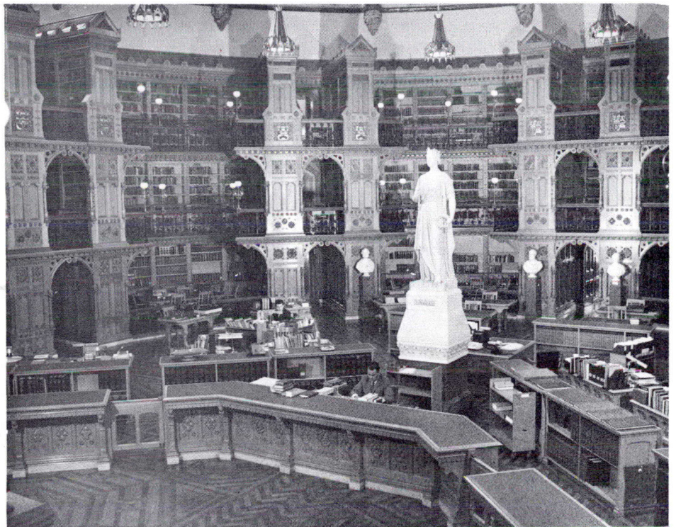
Marshall Wood's statue of Queen Victoria in the Library of Parliament.

"Nevertheless," the Review comments, "mainly because of the upswing in North America, the world economy will grow by almost 5 per cent." The recovery is prompted mainly by consumer demand for durable goods, whereas private business investment is still depressed. The Review comments, however, that "it may well be