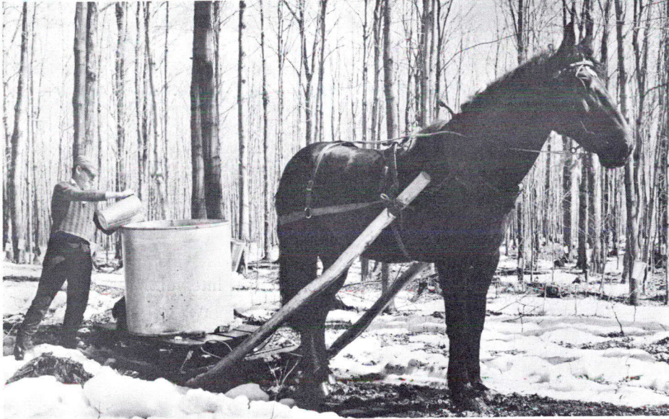
Collecting sap at Notre-Dame du Bon Conseil, Quebec.