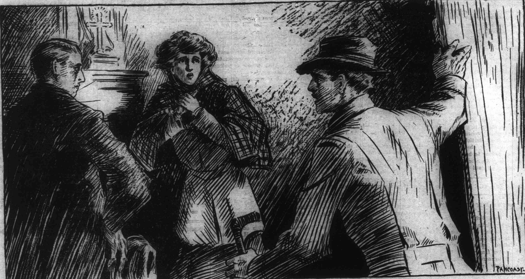
"He did not even look at her as he stepped between her and Ashe."