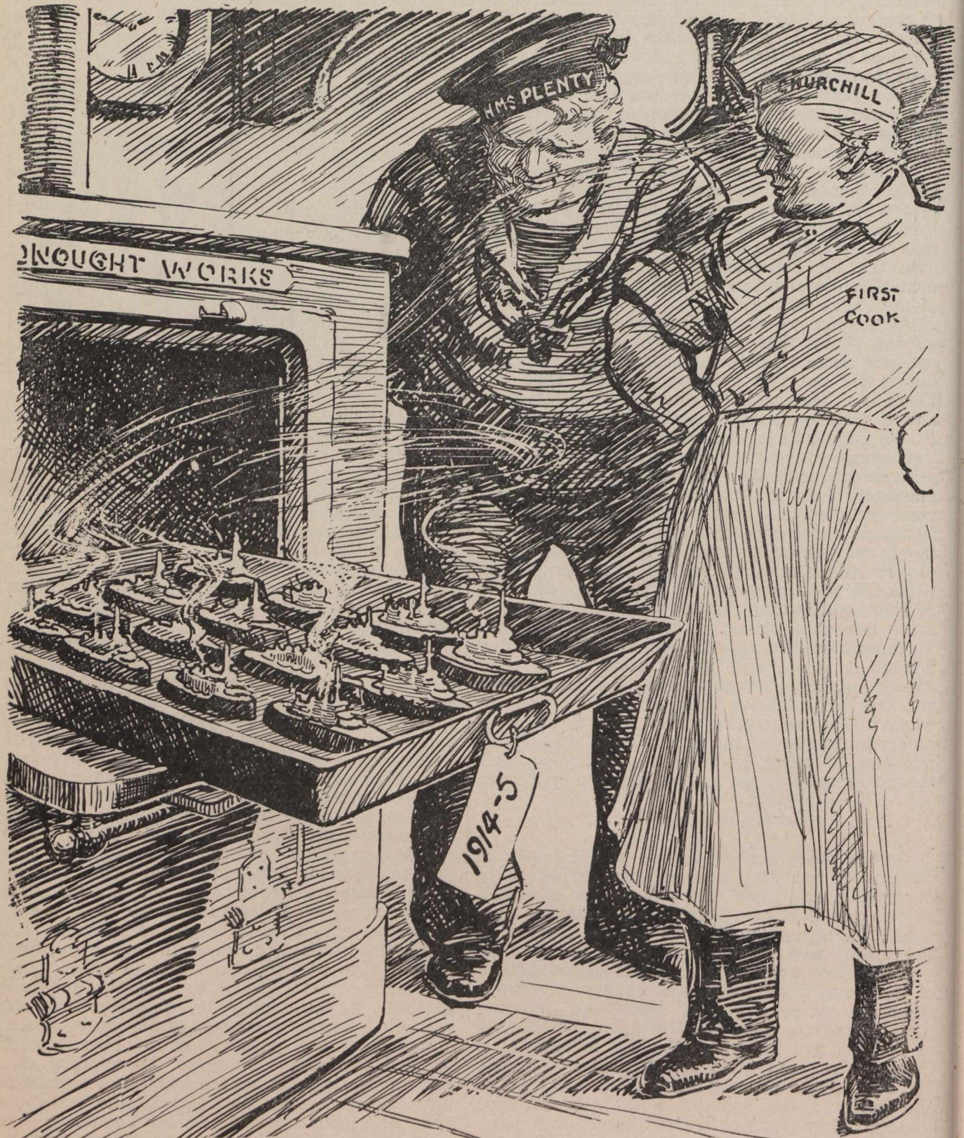
“During the period between the beginning of the war and the end of 1915, while the Germans will be receiving an accession of three ships, we shall receive a total of fifteen ships in all. —Rt. Hon. Winston Churchill, House of Commons, November 28, 1914.