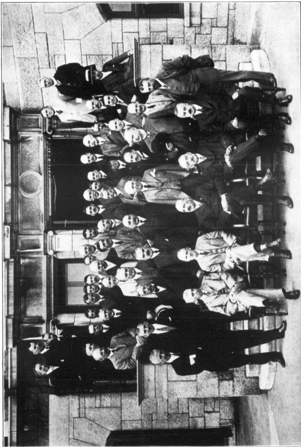
ANNUAL MEETING CANADIAN FIRE UNDERWRITERS ASSOCIATION HELD AT QUEBEC, 19TH & 20TH JUNE 1917

years has r of the nt Insur- managing of the rs to his upon this