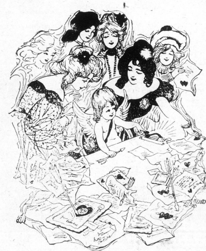
PIN DU SIECLE. And now behold Dame Science strides into the realm which Cupid guides. No nails are needed as of yore. No daily valentines follow.

The dishes are washed and put away, the heavy table drawn up to the fire, and Mrs. Darrel takes up her knitting. Her knitting on a sock for her boy! Five years ago she had begun it; each valentine's eve, since she has worked upon it.