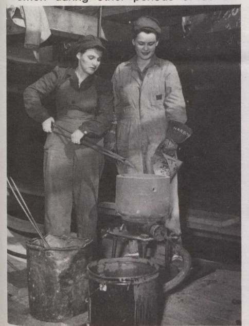
Female riveters at work on a navy frigate at Yarrow's Limited, Esquimalt, British Columbia.

In examining the many ways Canadian women contributed to the defence of their homes and country, cared for the wounded, prepared materials of war, served in the military and provided economic support in a troubled wartime economy, Women and War reveals that Canadian women have shared fully in their nation's wartime experience. While focusing on the two world wars of this century, the exhibition also refers to the role of women during other periods of conflict