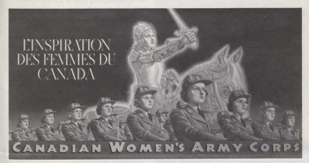
Canadian Women's Army Corps recruiting poster

The Canadian War Museum in Ottawa recently opened an exhibit, Women and War , which highlights the role played by Canadian women during periods of conflict throughout the country's history. The exhibition runs until September 1985.