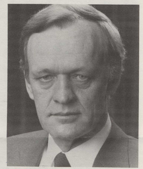
Jean Chrétien, Deputy Prime Minister and Secretary of State for External Affairs.

In his introductory remarks to the meeting in Jakarta, the External Affairs minister said that Canada had maintained its policy of accepting substantial numbers of refugees from Southeast Asia, and he announced that Canada would give