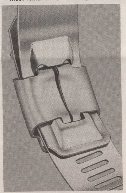
All Tridon full size gear clamps feature a unique interlocking design between the onepiece housing and the band.