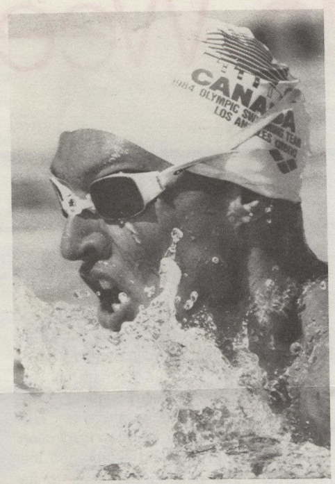
Two new world and Olympic records were established by Canada's Alex Baumann when he won two gold medals. He swam the 400-metre individual medley in 4:17.41 and the 200-metre individual medley in 2:13.34.

gold medallist winning the women's springboard event.