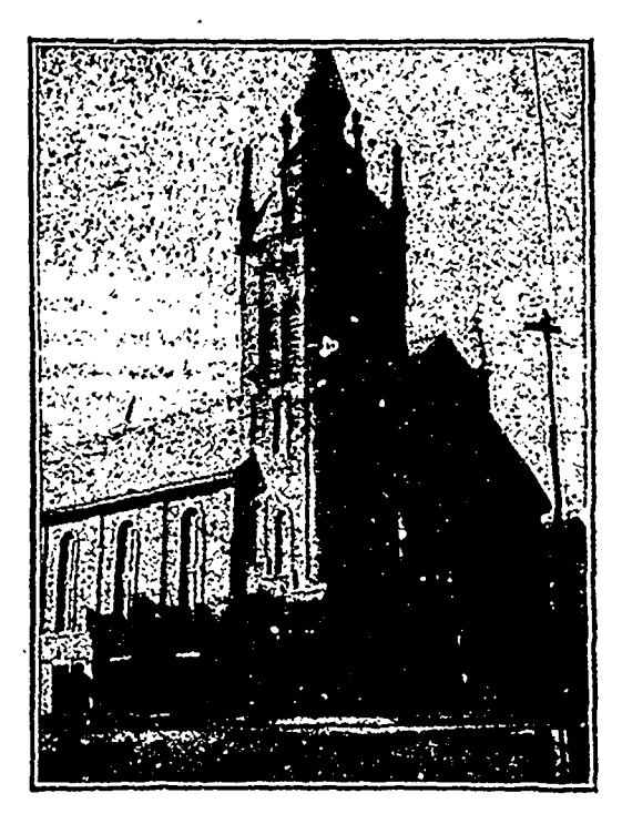
CENTRAL PRESBYTERIAN CHURCH, DETROIT, Headquarters for Canada and District of Columbia.

Situated upon the bank of her wonderful river, on whose calm bosom floats each year a greater