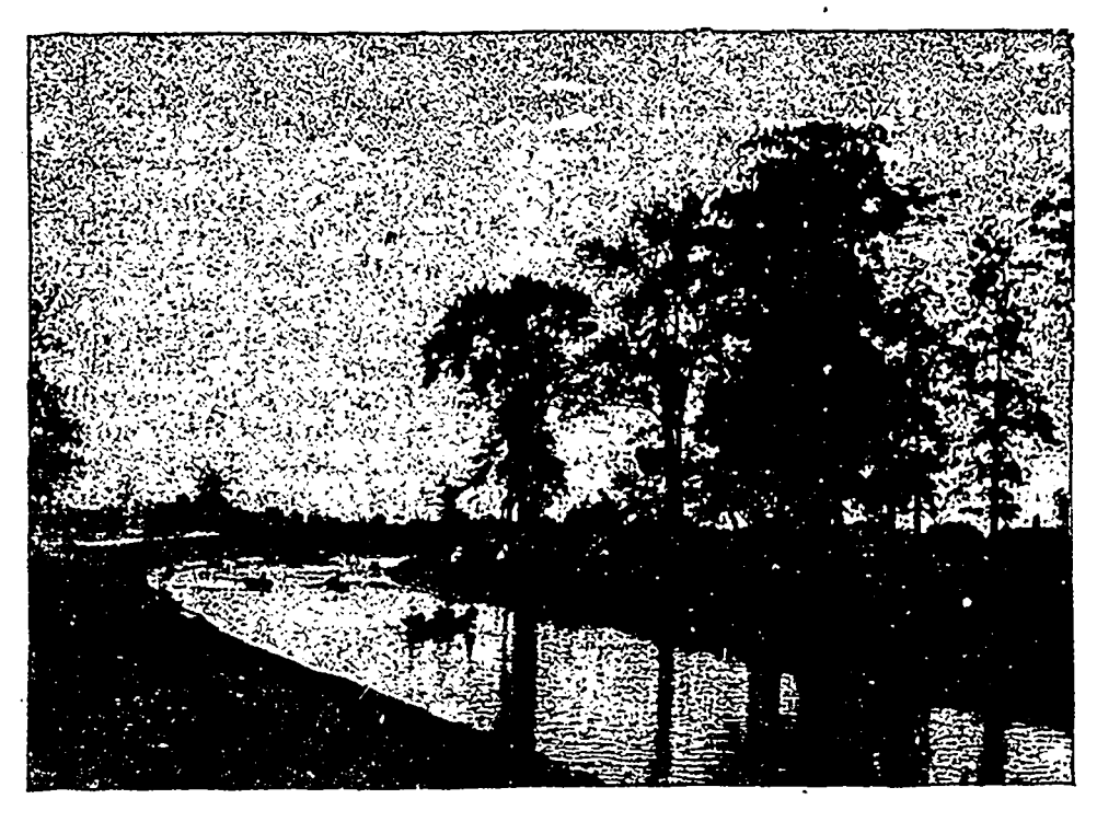
A BIT OF BELLE ISLE SCENERY, DETROIT.

Educational and philanthropic interests are prominent among the better things which are highly prized in the city. Our schools are a credit, and just at present the endeavor is making to secure legislation which will make possible