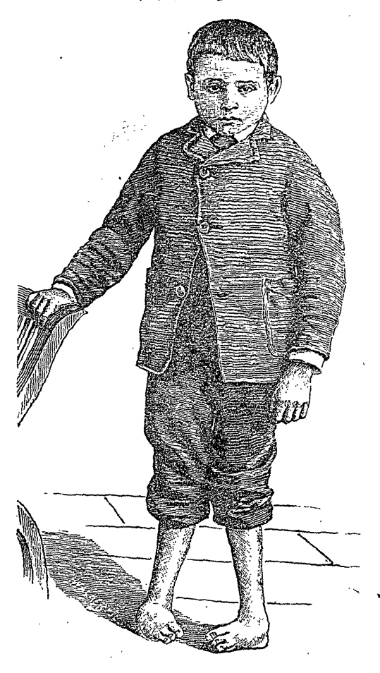
CASE IV. (Before the operation.)

In talipes equino-varus, however exaggerated the degree, there is, there can be, no contraction of either the abductor or